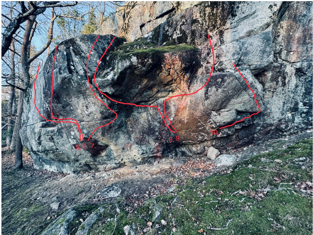
15. Slip Slope